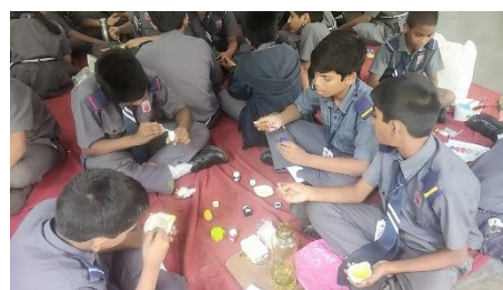
Blue Colour Day Celebration