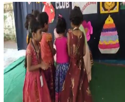
Diya Making Activity